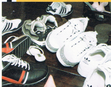
The well-heeled guests went shoeless inside Austin's home.

ATLANTA PRODUCER DALLAS AUSTIN ON HIS FASCINATION WITH THE Y-3 SPORTSWEAR LINE