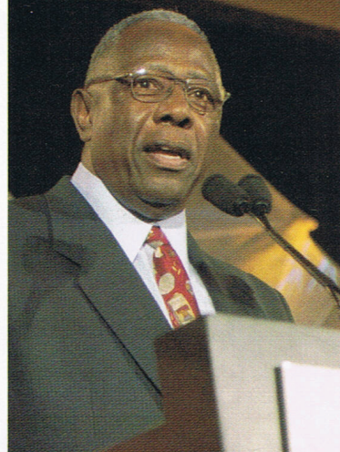
Hank Aaron accepts his award from BGCA.

"HERE I AM AT 24 AND I'M STILL A MEMBER OF THE BOYS & GIRLS CLUB."