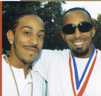
Ludacris and Dallas Austin at the Y-3 party

ERNIE JOHNSON SR., COMMENTING ON AARON'S 755 HOME RUNS