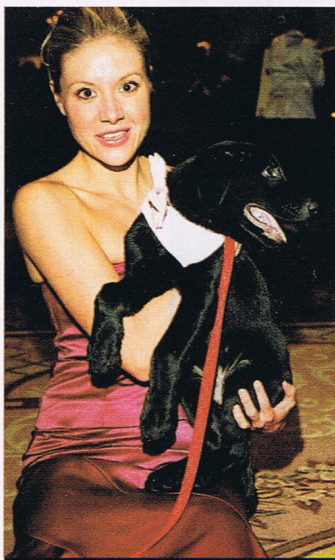
A Pink Tie Ball hostess with the $10,000 puppy

"I THINK A CHILD WHO HAS DONE EVERYTHING SHE'S DONE DESERVES A PUPPY."