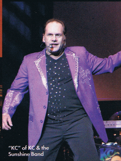
"KC" of KC & the Sunshine Band