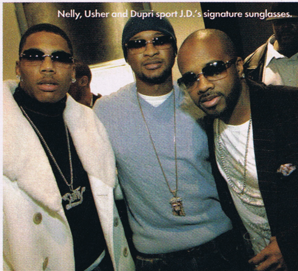
Nelly, Usher and Dupri sport J.D.'s signature sunglasses.