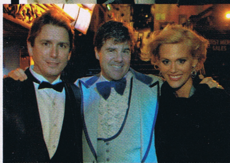
The cast of TBS's Dinner and a Movie at the X-MAS Party

CARTIER: BEN ROSE; X-MAS PARTY: COURTESY OF TED PIG-RODA