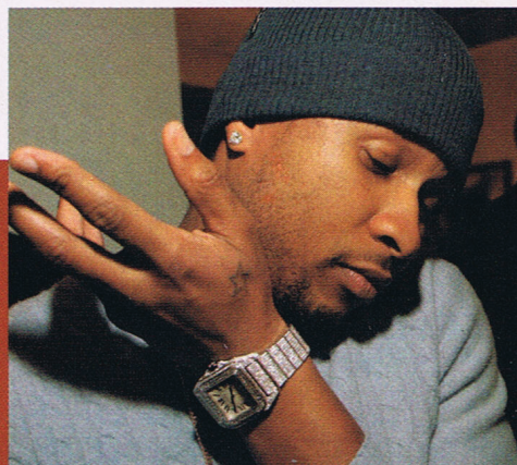
Usher tries on a $375,000 Cartier watch.