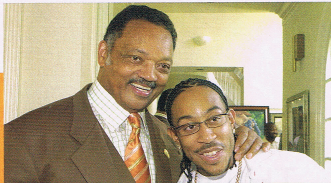
Unlikely duo: the Reverend Jesse Jackson and rapper Ludacris

JESSE JACKSON SPEAKING TO RAPPER LUDACRIS, WHO WALKED IN LATE DURING JACKSON'S SPEECH