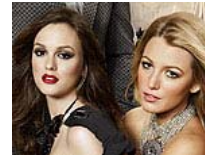
vamp it up for their season 3 cast photo