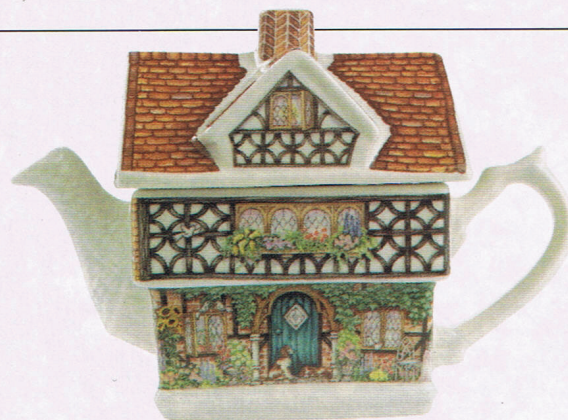
COUNTRY COTTAGES TEAPOT, $45, Taste of Britain