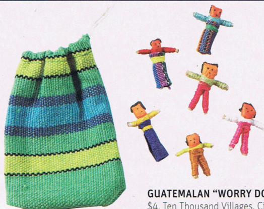
GUATEMALAN "WORRY DOLLS," $4, Ten Thousand Villages, City Walk