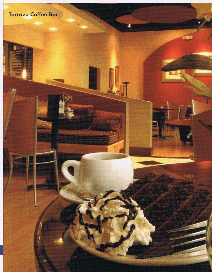
Tarrazu Coffee Bar