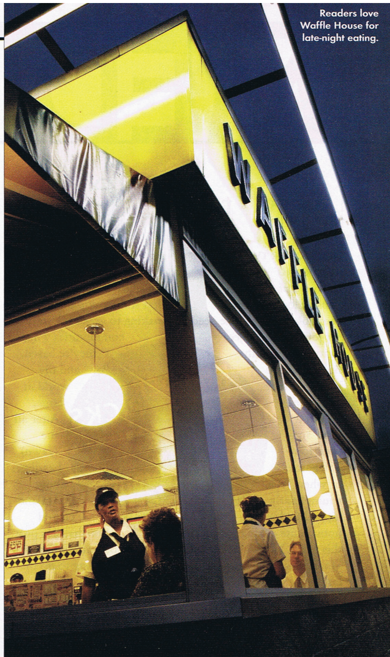
Readers love Waffle House for late-night eating.

Brad Paisley. This place can pack up to 5,000 cowboy hat-clad folks at a time. Buying a Wild Card gets you special discounts on certain nights. Take the teens to family night, held most Sunday evenings.