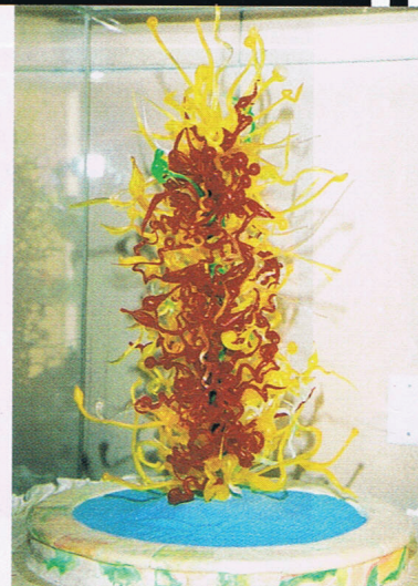
The winning entry, a replica of Chihuly's Howell Fountain Installation

"WE HANDED OUT COPIES TO ALL OF OUR BOARD MEMBERS; THEY'LL BE TESTED ON IT."