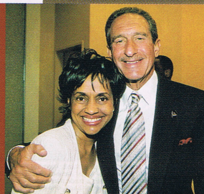
Judge Glenda Hatchett and Arthur Blank at the United Way celebration