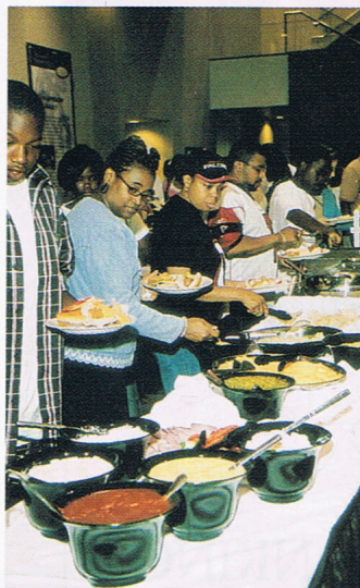
The United Way's Summer Fellows chow on pre-game fare.

"I'VE NEVER EATEN ANYTHING THAT LOOKED LIKE THIS."