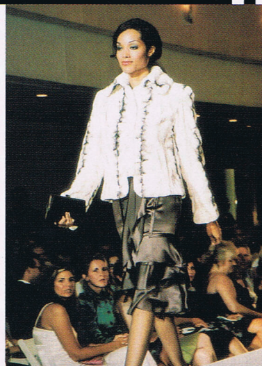
On the catwalk at Fashion Cares

"I'M OBVIOUSLY GOING FOR THE MINIMALIST LOOK."