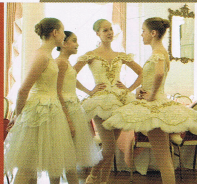
Bunheads from the Atlanta Ballet Centre for Dance Education at Corps de Ballet