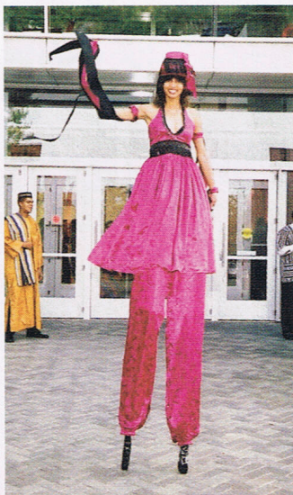
A stilted performer greets guests at the NBAF gala.

"WE HAVE NOT ACHIEVED THE PROMISED LAND, WE'RE STILL IN A STRUGGLE."