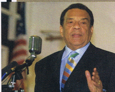
Former Mayor Andrew Young at the ARCHE event

FORMER MAYOR ANDREW YOUNG SPEAKING ON THE 50TH ANNIVERSARY OF THE BROWN V. BOARD OF EDUCATION DESEGREGATION RULING