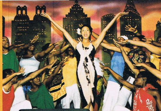
The Freddie Hendricks Youth Ensemble performs at the NBAF gala.