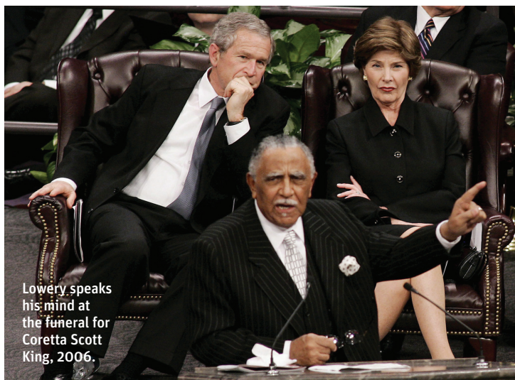
Lowery speaks his mind at the funeral for Coretta Scott King, 2006.

In 1968, the year King was assassinated, Lowery was transferred from Birmingham to southwest Atlanta to assume the pastorate of Central United Methodist Church. In 1977, he succeeded Abernathy as SCLC president. From 1986 until his retirement in 1992, Lowery served as pastor of Cascade United